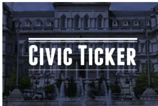
Civic Ticker Logo