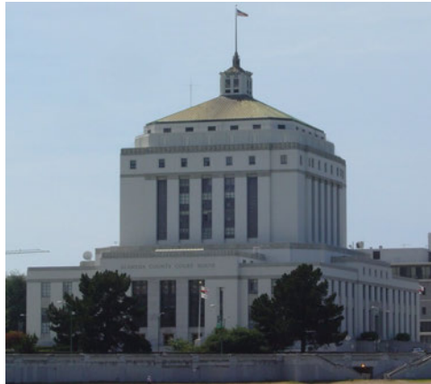
Rene C. Davidson Courthouse, 1225 Fallon Street, Oakland, California