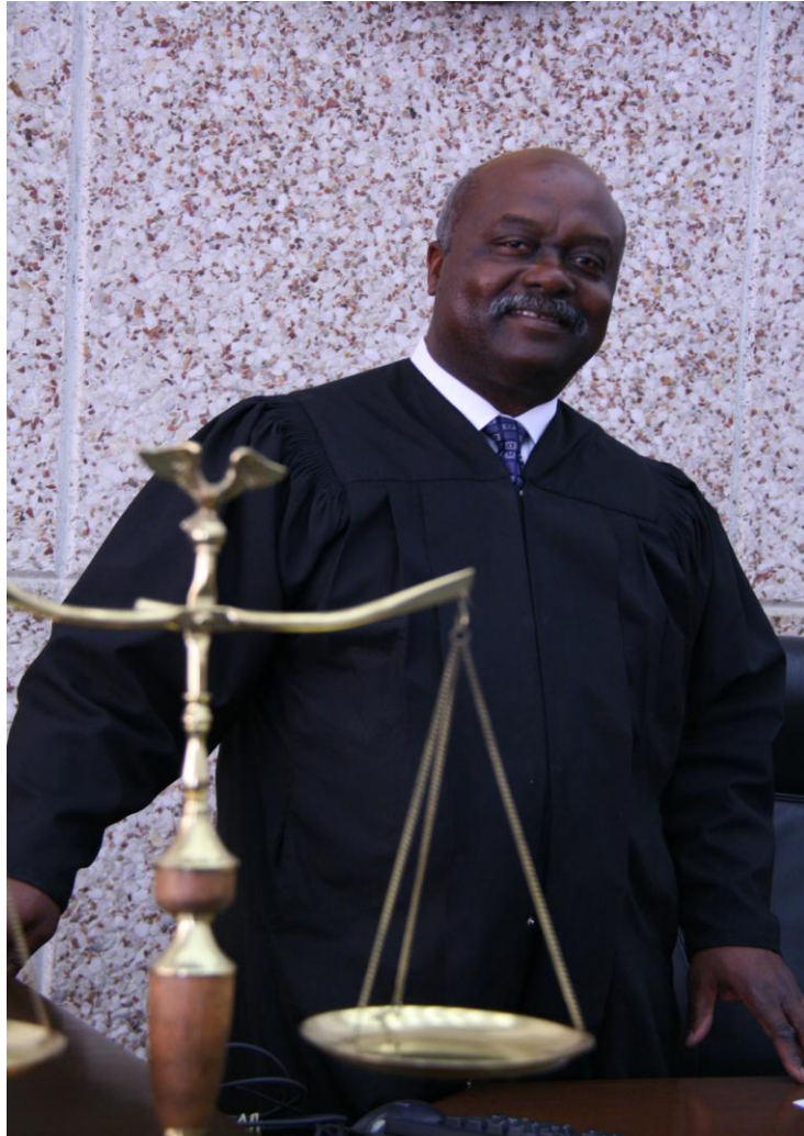
Honorable C. Don Clay January 1, 2012 – Present